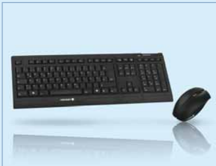
Wireless keyboard with mouse and integrated charging function via USB cable