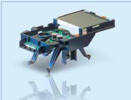
Display and control unit for instant water heater