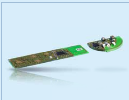
Compact wireless remote switch with sender and receiver module