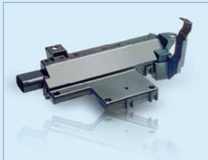
Completely sealed electronic control unit with sensors for keyless entry system. Mounted in side door of cars