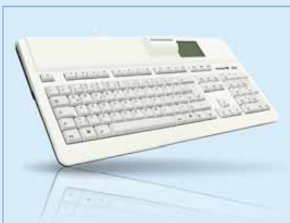
Integrated system-solution, keyboard with card-reader for electronic health insurance card