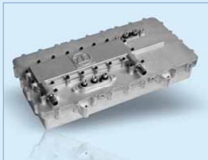
Power electronics for hybrid systems of commercial vehicles