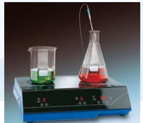
Multi-Module in laboratory